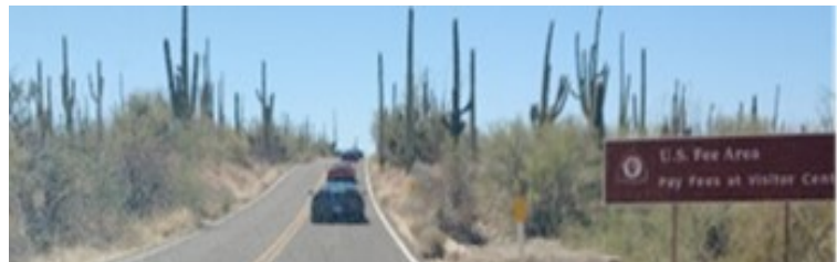
Driving thru Saguaro Nat'l Park (right)