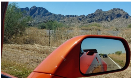
A view of Picacho Peak (left)

This was our Drivers meeting at Kohls in Casa Grande. This picture was taken by the security guard in Kohls. She noticed us on the cameras and rushed out to see us and the cars. We stopped at a Shell station for fuel, drinks and southwestern souvenirs. Actually, it is a pretty high quality and well stocked souvenir shop. A few folks added to their "stuff" there. Onwards through the backside of the Saguaro National Park, with hills and mountains on both sides, we now know there's a good reason to have the local Plattens plan the route. They know all the roads on both sides of I-10.